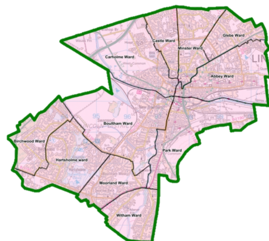
Figure 2: Ward map of Lincoln

1.6 The main concentration of deprivation is in the Park Ward – this being the Sincil Bank residential area of the City, which is mixed tenure. Other Wards, including Birchwood, Moorland, Castle and Glebe also contain LSOAs with deprivation levels in the worst 10% of the country.