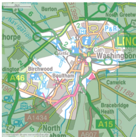
Figure 1: ONS map of the City

1.2 As a district council the City of Lincoln Council is both the Local Housing Authority and the Local Planning Authority, with Lincolnshire County Council having responsibility for social services and transport within the city.